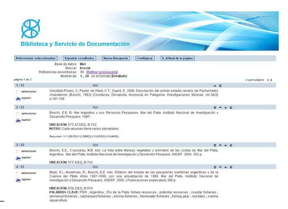
Figure 1. ABCD online catalog of INIDEP Library

displayed separately, differentiating ABCD meta-search from federated search with aggregated search results or from discovery tools with pre-indexed database.